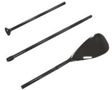
3 Pieces Carbon Fiber Paddle