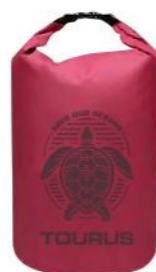
Dry Bag 10L