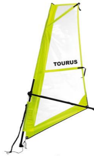
4M 2 Sail