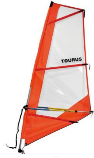
3M 2 Sail