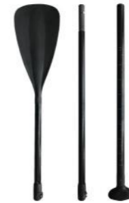
3 Pieces Alu Paddle