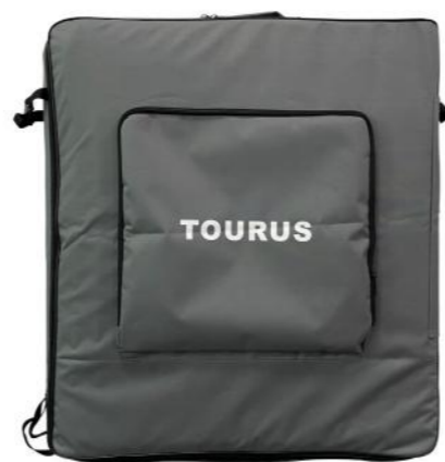
Foil Board Wheeled Backpack