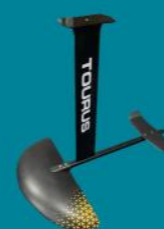
Full Carbon Foil