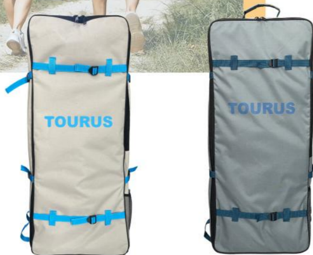
High Quality Backpack