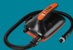
Electric pump 20PSI