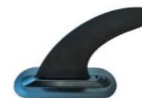
Snap In Central Fin