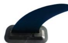
Slide In Central Fin