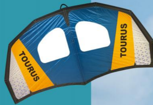
3M 2 Wing/4M 2 Wing