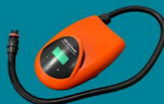
Electric pump With Battery 20PSI