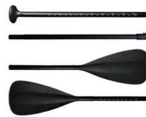
4 Pieces Sup To Kayak Paddle