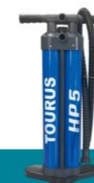
Triple Action Pump