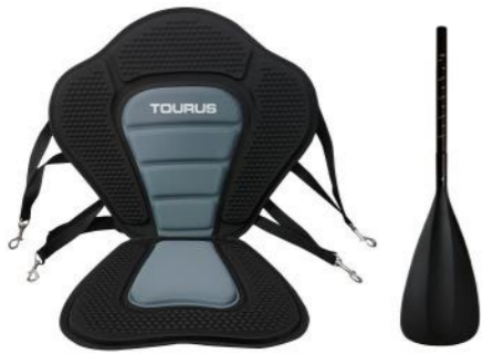
SUP to Kayak Kit