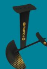
Carbon + Aluminum Foil